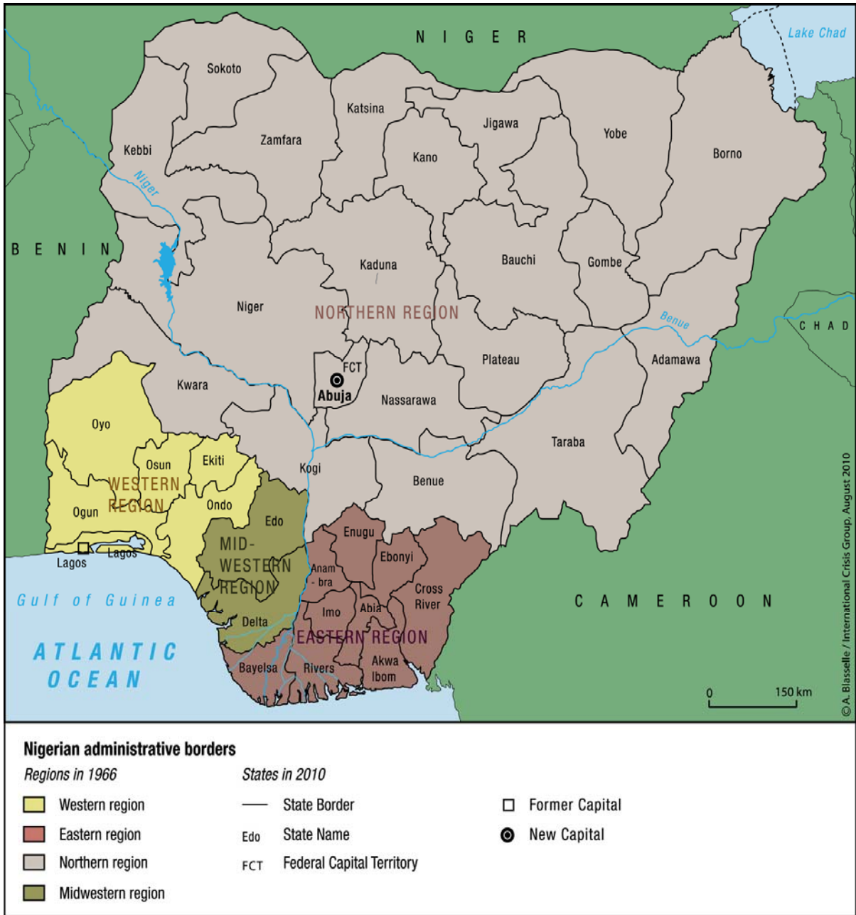
Figure 1. Nigerian Administrative Borders 17

Nigeria has been rife with wars and power struggles throughout its history. Geographic location and environment enabled some societies to develop into large states, while others to village-based system of government. Prior to European involvement,